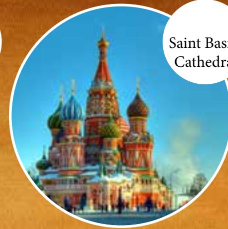
Saint Basil's Cathedral